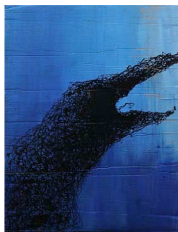
"Untitled," from the Angry birds series (2012). Used cardboard, automotive paint / reference image.