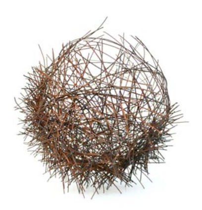
[Image G3] "Drawing in Space" (2014). Protest wire / reference image.