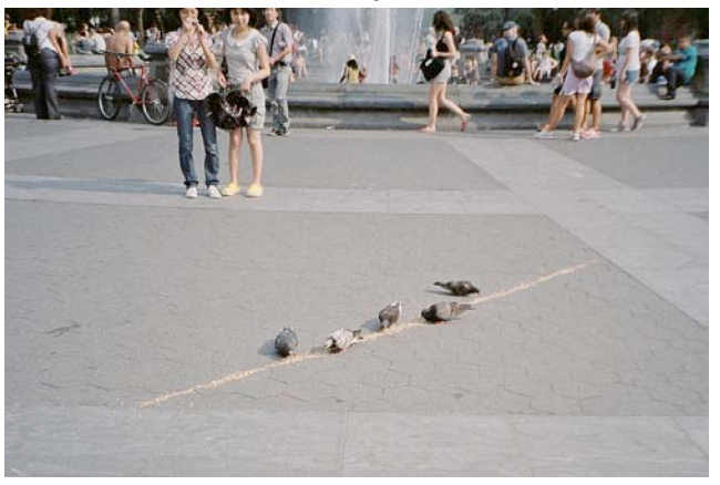
[Image A5] "Civilization" (2011). Birdseed, pigeons / reference image.