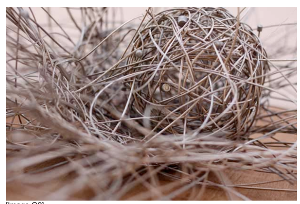
[mage G2] "Drawing in Space" (2014). Bicycle cables / reference image.