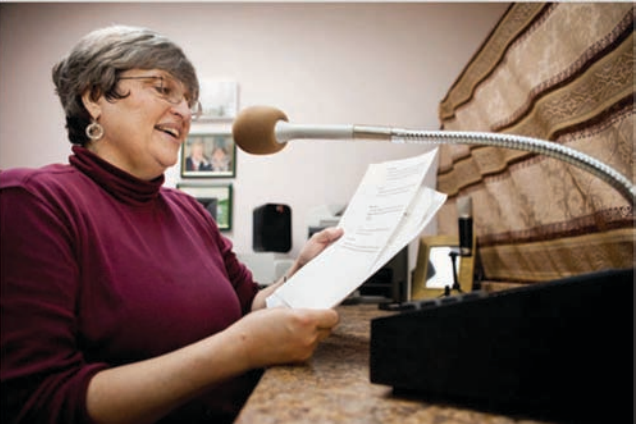
[Image A4] "The Voice" (2013). Five-channel audio installation / commissioned for the Singapore