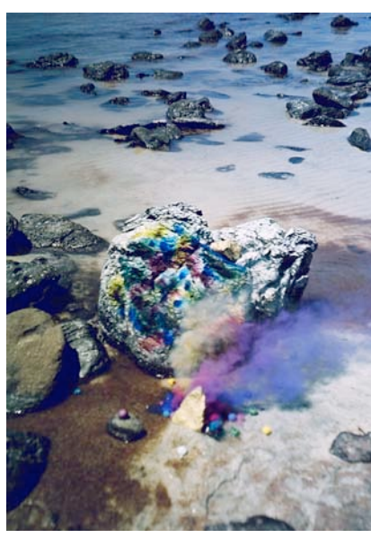
[Image A3] "Continuity Drift" (2013). Natural pigment dyes / reference image.